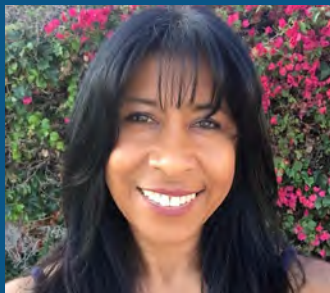
Shirley McCombs-Swayne, Photographer / Piccolo